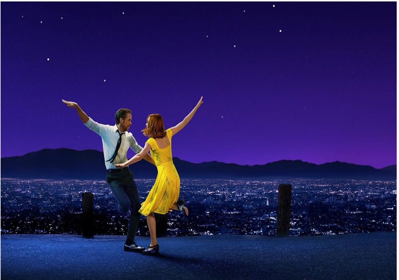
LA LA BLAND: Neither Gosling nor Stone do themselves justice.